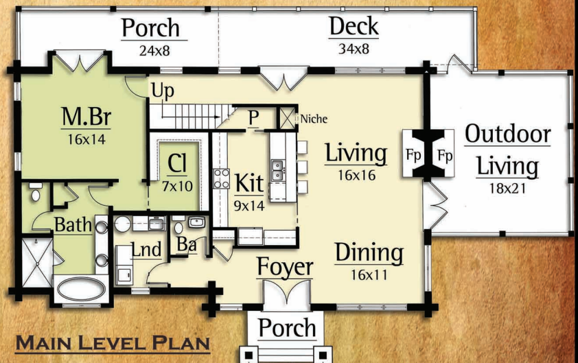
MAIN LEVEL PLAN

AREA CALCULATION: MAIN LEVEL: 1,513 S.F. UPPER LEVEL: 765 S.F. TOTAL: 2,278 S.F.